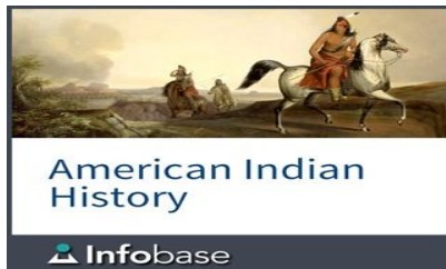
American Indian History Online