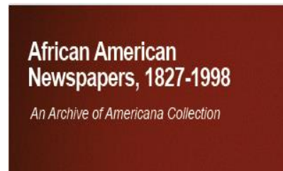
African American Newspapers