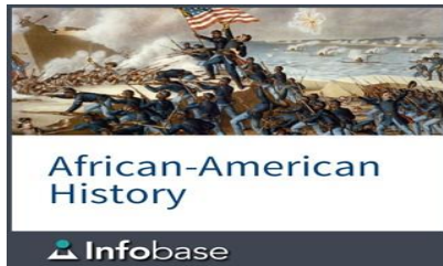
African American History